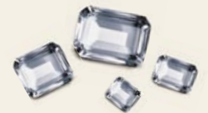
Zahari @ Mohd Zin bin Idris

A stylized, cursive handwritten signature in black ink, appearing to read 'Zahari'.